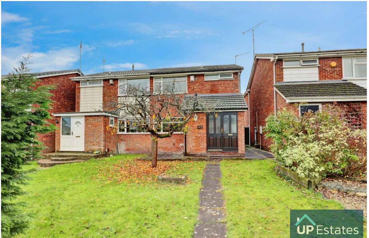
Blandford Drive, Coventry